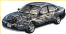
Auto - under the hood