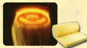
Heat Treatment Furnace